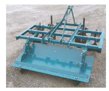
1321N-D Features an 8" narrower frame for narrow, compact tractors in hoophouses. Tell us what you need for special applications.