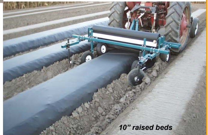
10" raised beds

Crop protection practices vary widely. Besides row tunnels are floating row cover, hot pots and hoopouses. Each offers advantages and growers may use more than one solution.