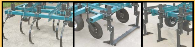
7-shank Chisel Plow