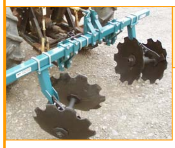
Re-use hitch, toolbar

As you progress, invest in additional toolbars to set-up dedicated machines.