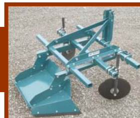
1063 Toolbar Frame