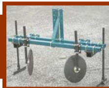
1001 Toolbar Frame