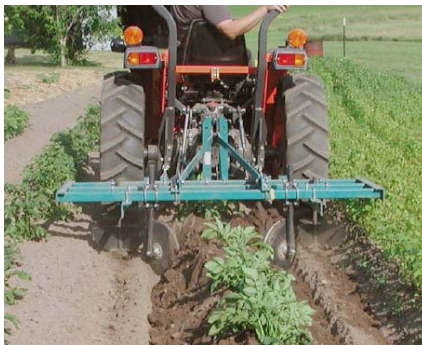
This bed shaper toolbar has the pan removed and hilling disks adjusted to hill potatoes

The 1063 toolbar features three 2" square toolbars at 12" spacing and used on the bed shaper and cultivator. The 1001 / 20102 toolbar combination is used on the mulch layer and wheel planter. Hilling disks and wheel punchers are mounted on the 1001 or 1063. The ripper and furrower are mounted to the 1001. The 1072 and 1073 are most versatile for a row crop cultivator and all above attachments can be mounted on it with some additional mounting hardware. 1072 features two toolbars for the simplest row crop set-ups