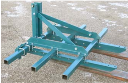
Toolbar main frames for solid construction and versatile applications