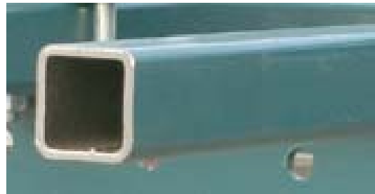
Heavy 3/16-wall square toolbars