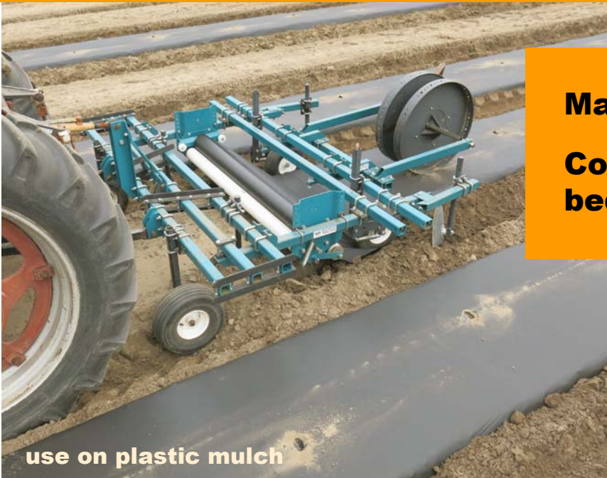
use on plastic mulch

Mark rows / plant locations Combine with bed shapers & mulch layers