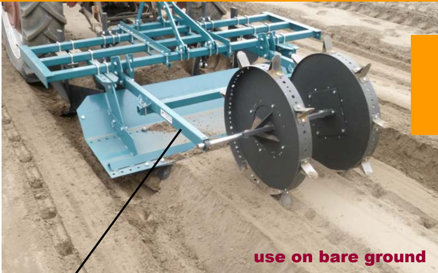
use on bare ground