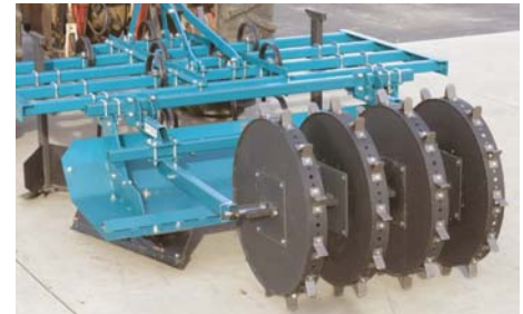
A typical set-up for garlic or onions

A significant benefit of puncher wheels behind bed shapers is precision planting. Rows are perfectly centered on beds to allow close cultivation. Puncher frames for Bed Shapers are wider and heavier to accommodate more wheels.